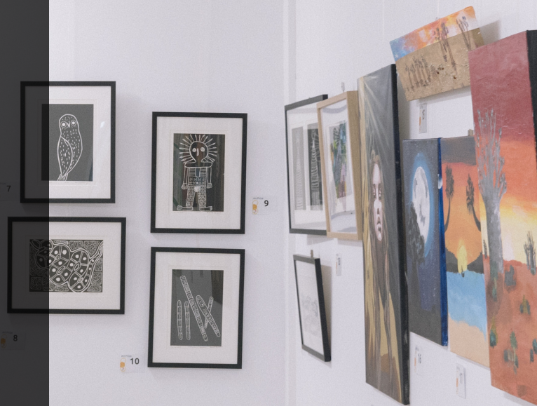
(Front Cover) Winner, Art 2023 "Desert Aurora" Deidre Butter

The festival is now known as the Kimberley Art and Photographic Prize (KAPP). The exhibition runs for 2 weeks after the opening night.