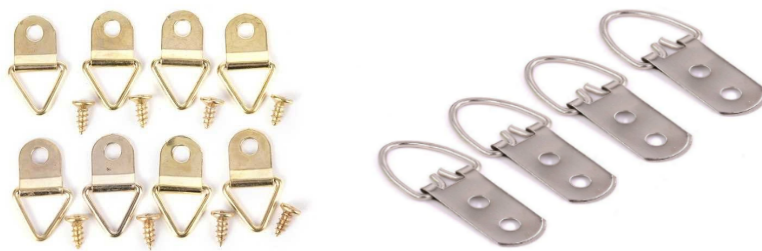
Figure 1 Triangle ring and D ring hanging devices

Thread picture-quality cord or braided wire through the two rings, make sure its tight so that the wire or cord does not droop. This would prevent the loose ends of the wire catching in the hanging system or damaging your artworks.