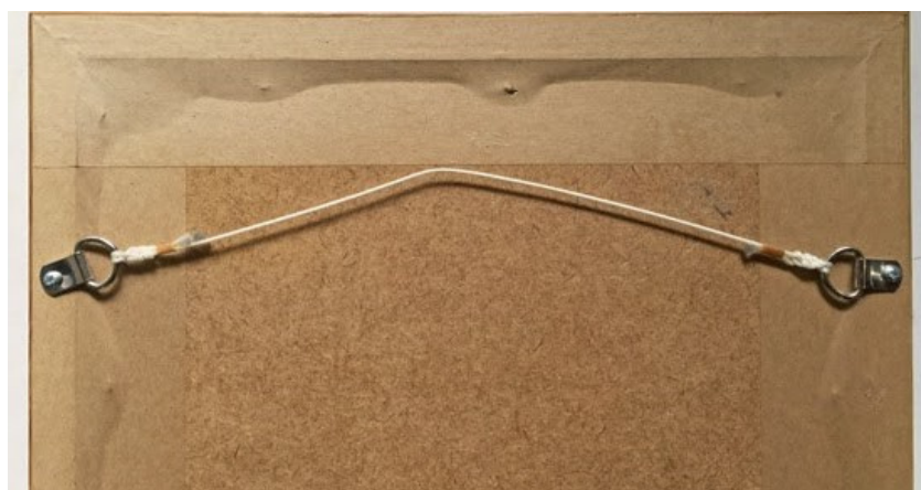
Figure 2 Example of hanging device installation